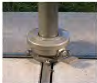
Cross Rotating Base

Please see our price list for more detailed product specifications.