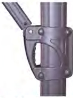
1. GPT Tilt Mechanism