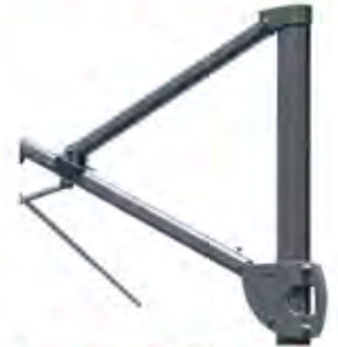
8. Brace Back Tilt