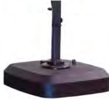
6. Power Base