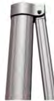
7. Top Holder