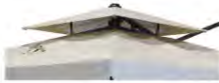
2. 2nd Deck Vent