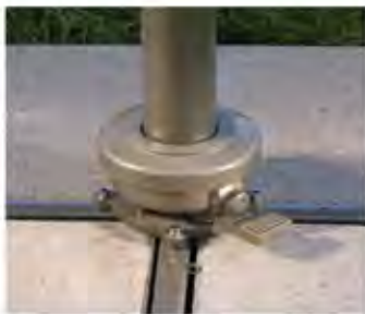
Cross Rotating Base