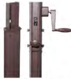
3. H Style Base