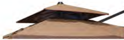
2. 2nd Deck Vent