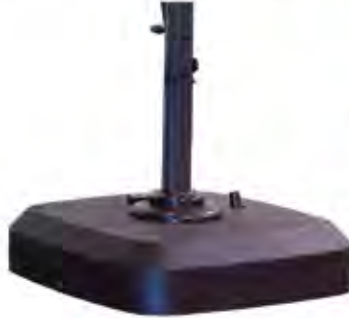
6. Power Base