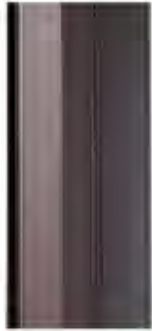
5. Frame Shape