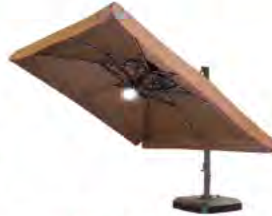
7. Tilted Position