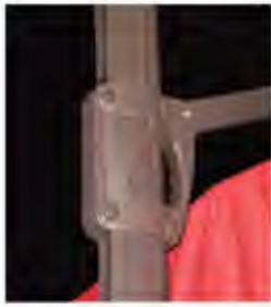
1. GPT Tilt Mechanism