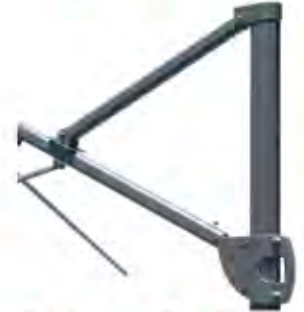
8. Brace Back Tilt